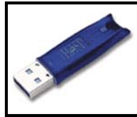
HASP Hardware Key